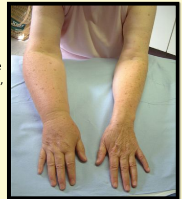
Figure 1. Swollen arm as a result of lymphoedema after breast cancer treatment

Reflexology is a physical therapy focusing on the feet. Practitioners use specific pressure with thumb, finger and hand techniques to stimulate these reflexes on the premise that this effects a physical change in the body. Anecdotally, cancer patients suffering from lymphoedema have reported positive effects on the swollen arm after reflexology treatment.